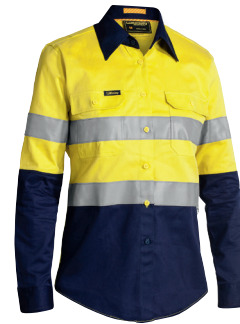
BL6448T WOMEN'S 3M TAPED 2T INDUSTRIAL COOL VENT SHIRT LS