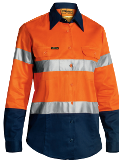
BLT6456 WOMEN'S 3M 2T HI VIS DRILL SHIRT LS