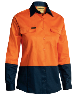
BL6267 WOMEN'S 2T HI VIS DRILL SHIRT